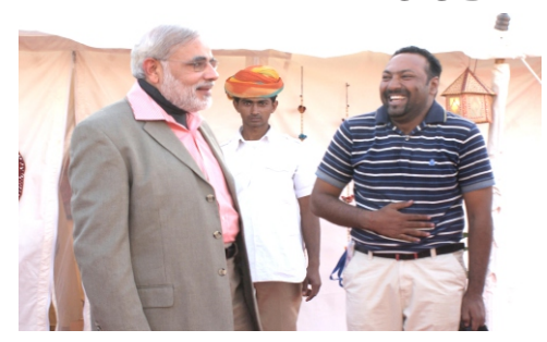
Mr. Mohit Mangal sharing a moment with Honourable Prime Minister Shri Narendra Modi